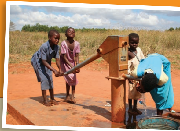
Girls pumping water from a clean water source.

www.plan.org.au/ourwork/southernafrika/malawi