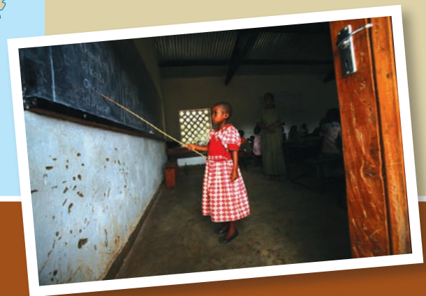
Giving answers in a Plan support school.