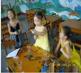
New photos: China ECCD program – December 07